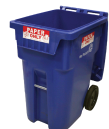
Approved Recycle Cart Must be outfitted with the Standard North American Lifting Mechanism and must be labeled for one type of material (i.e. paper).