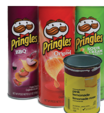
Spiral Wound chip & frozen juice cans, discard plastic lids