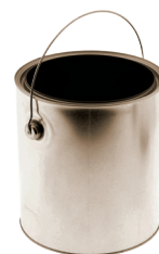
Empty Metal Paint Cans remove & recycle metal lids