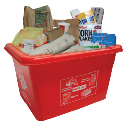
Approved Red Box Box Weight Limit: 20 kg / 44 lb

Paper must be placed in the Red Box or the Paper Recycling Cart. Paper items can't be mixed with container items in the same box/cart. If they are mixed - the whole box/cart becomes contaminated as we have a two-stream program and will NOT be recycled.