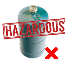
No Propane Tanks