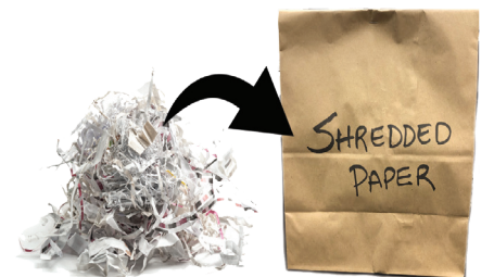
Shredded Paper & White Office Paper place in a paper bag and label