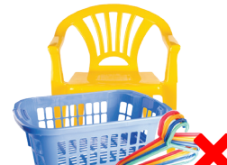
No Plastic Products