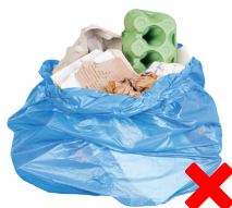
No Plastic Bags

Cross Contamination: Refers to the act of mixing paper products and containers in the same box/cart. This causes serious operational issues at our facilities.