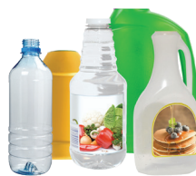
All Plastic Bottles remove & discard caps