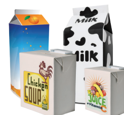
Cartons discard any plastic caps