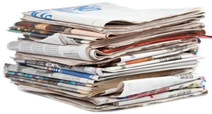
Newspapers remove any plastic bags/inserts