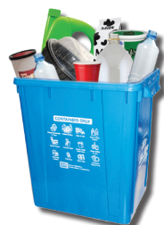
Approved Blue Box Box Weight Limit: 20 kg / 44 lb

Containers must be placed in the Blue Box or the Container Recycling Cart. Container items can't be mixed with paper items in the same box/cart. If they are mixed - the whole box/cart becomes contaminated as we have a two-stream program and will NOT be recycled.