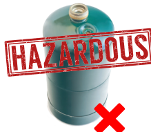
No Propane Tanks