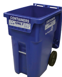
Approved Recycle Cart Must be outfitted with the Standard North American Lifting Mechanism and must be labeled for one type of material (i.e. containers).