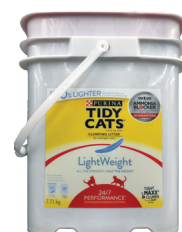
Buckets / Pails remove & discard lids, remove any metal handles