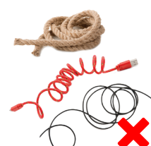
No Stringy Things