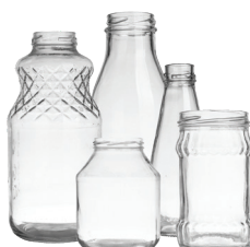
Glass Bottles & Jars remove & recycle metal lids