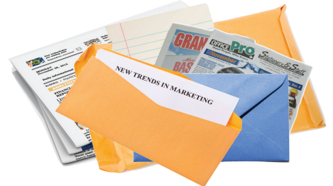
Magazines & Junkmail remove any plastic bags/inserts