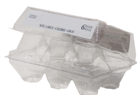
Plastic Egg Cartons