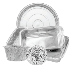
Aluminum Trays, Plates & Foil