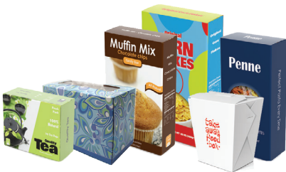
Boxboard remove any plastic liners/bags