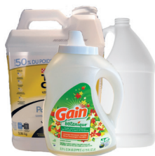
Plastic Jugs remove & discard caps