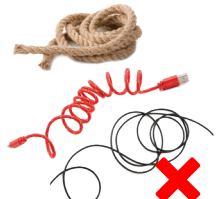
No Stringy Things