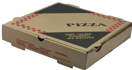
Pizza Boxes please eat or remove pizza