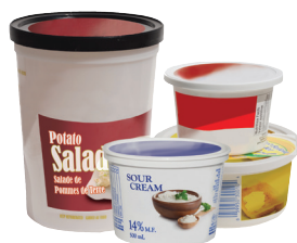
Plastic Tubs & Lids tub lids CAN be recycled