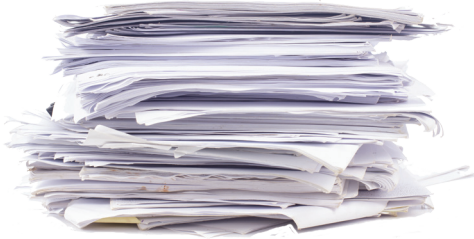
White Office Paper can be placed in a paper bag

All paper products below must be EMPTY (No Lids / No Food / No Liquids).