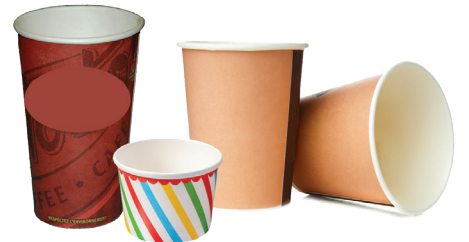
Paper Containers & Cups