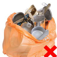
No Plastic Bags

Cross Contamination: Refers to the act of mixing paper products and containers in the same box/cart. This causes serious operational issues at our facilities.