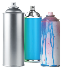
Empty Aerosol Cans remove & discard lids

All containers below must be EMPTY and LOOSE in the box/cart.