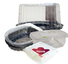
Clamshells & Trays (Plastic)