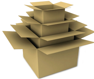
Cardboard breakdown boxes no larger than 30"x 30"x 30"