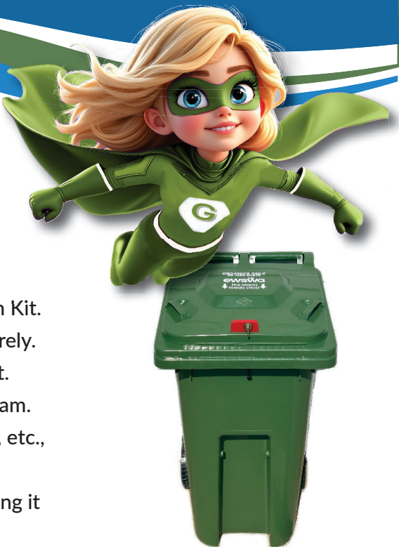
Superhero Evangeline says using your Green Bin can reduce your garbage by up to 50%!