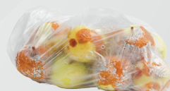
No Plastic Bags