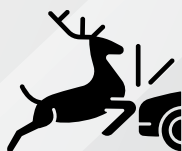
Dead Animal Carcasses (hunted, roadkill, etc.)