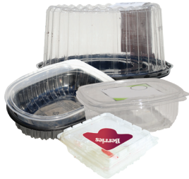
Clamshells & Trays (Plastic)