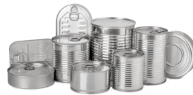
Metal Cans & Lids remove & recycle metal lids