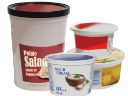
Plastic Tubs & Lids tub lids CAN be recycled