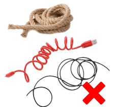
No Stringy Things