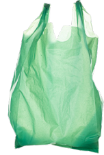
EMPTY Flexible Plastic Bags empty bags (e.g. grocery store plastic bags) can be placed inside each other (bundled) - no loose plastic bags