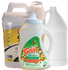
Plastic Jugs remove & discard caps