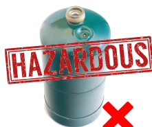
No Propane Tanks

Cross Contamination: Refers to the act of mixing paper products and containers in the same box/cart. This causes serious operational issues at our facilities.