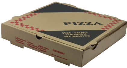
Pizza Boxes please eat or remove pizza - if bottom is overly greasy, please tear off and throw in garbage