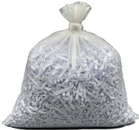
Shredded Paper & White Office Paper place in a clear plastic bag - ONLY shredded paper can be placed in a clear plastic bag