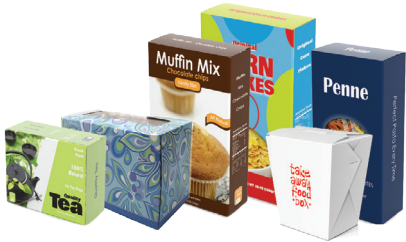
Boxboard remove any plastic liners/bags