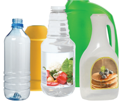
All Plastic Bottles remove & discard caps