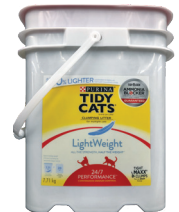
Buckets / Pails discard lids, remove any metal handles

Containers must be placed in the Blue Box or the Container Recycling Cart. Container items can't be mixed with paper items in the same box/cart. If they are mixed - the whole box/cart becomes contaminated (as we have a two-stream program) and will NOT be collected.