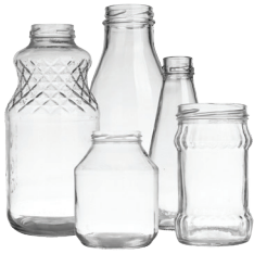
Glass Bottles & Jars remove & recycle metal lids