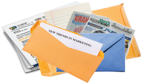
Magazines & Junkmail remove any plastic bags/inserts