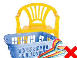
No Plastic Products