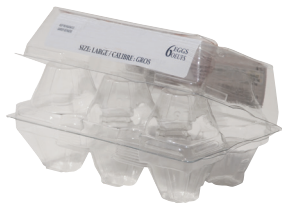
Plastic Egg Cartons